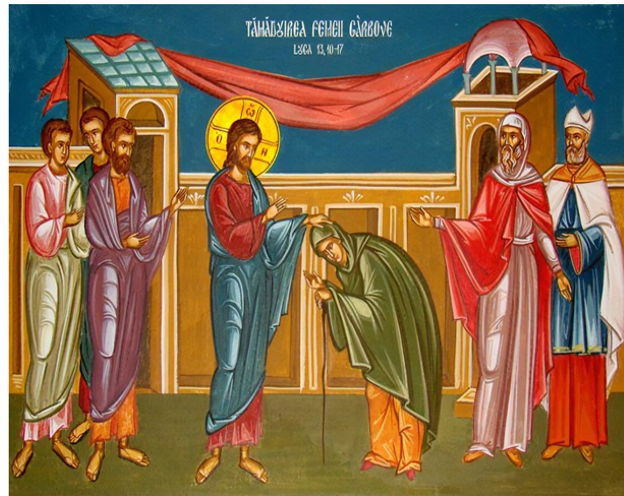
JESUS HEALING THE WOMAN BENT AND BURDENED WOMAN