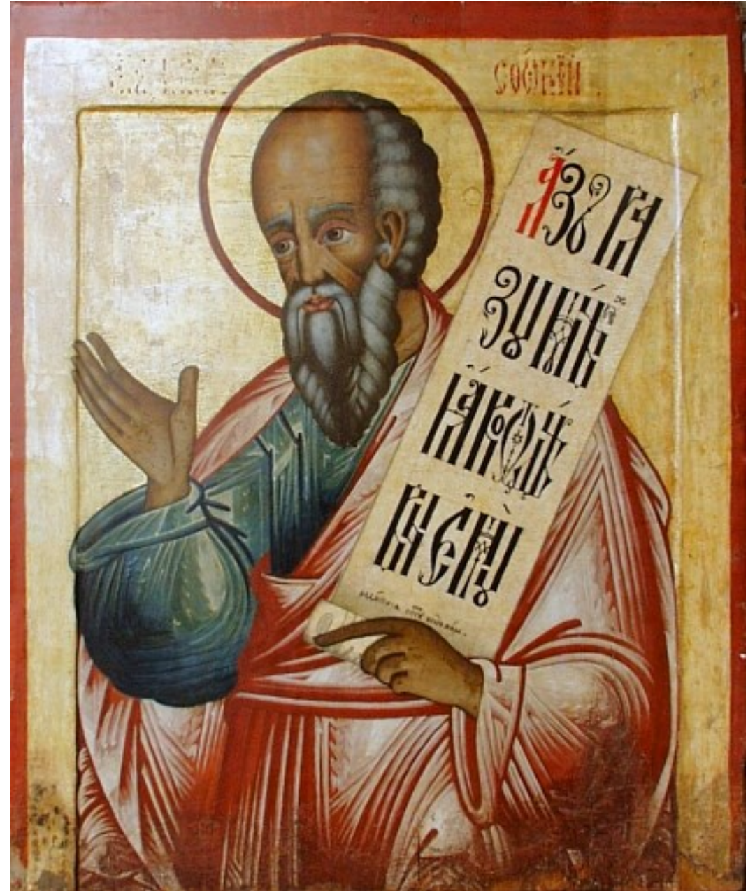
PROPHET ZEPHANIAH (DEC. 3)

FOURTEENTH SUNDAY AFTER THE HOLY CROSS DECEMBER 3, 2023