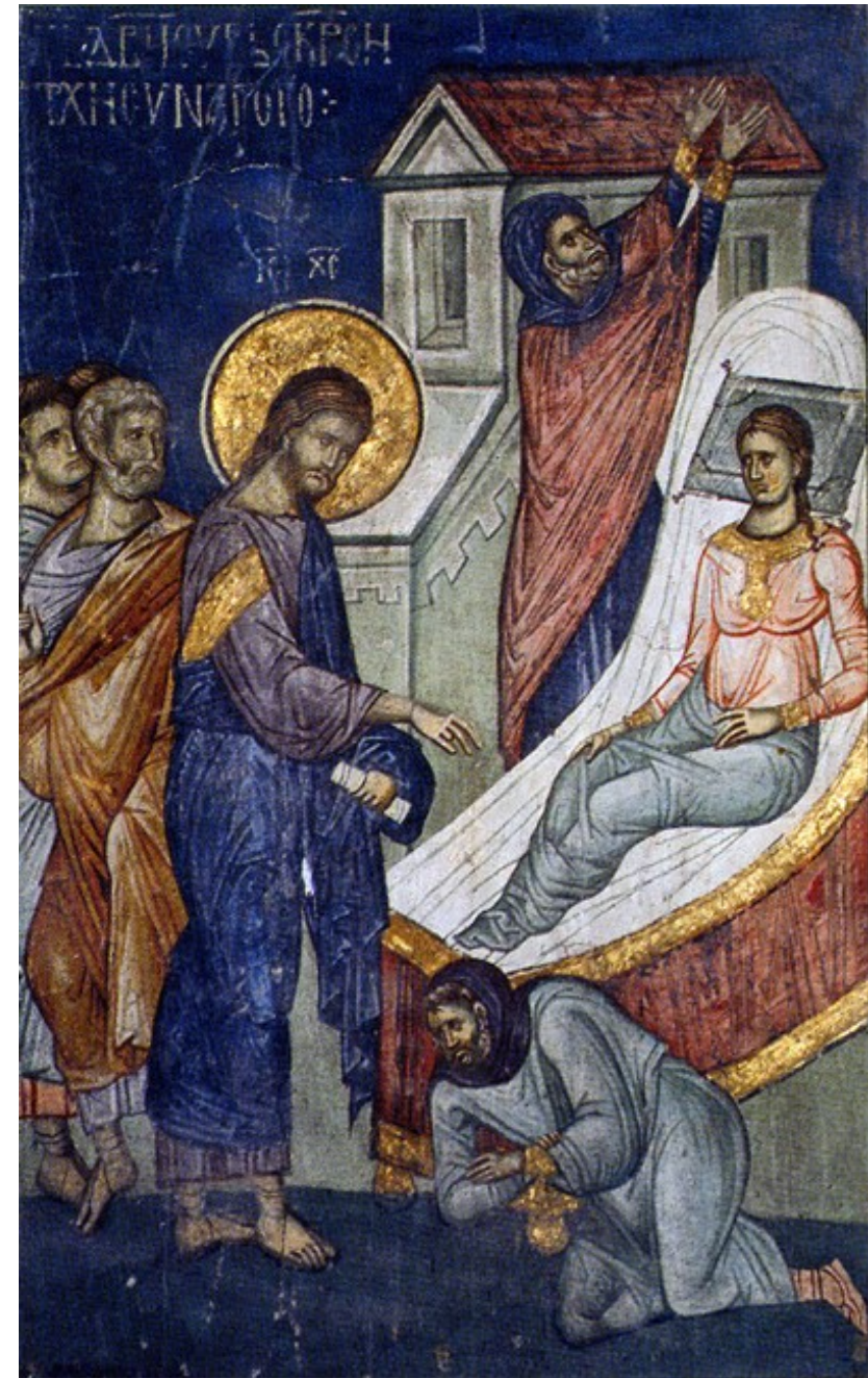
RAISING OF JAIRUS' DAUGHTER

SEVENTH SUNDAY AFTER THE HOLY CROSS OCTOBER 29, 2023