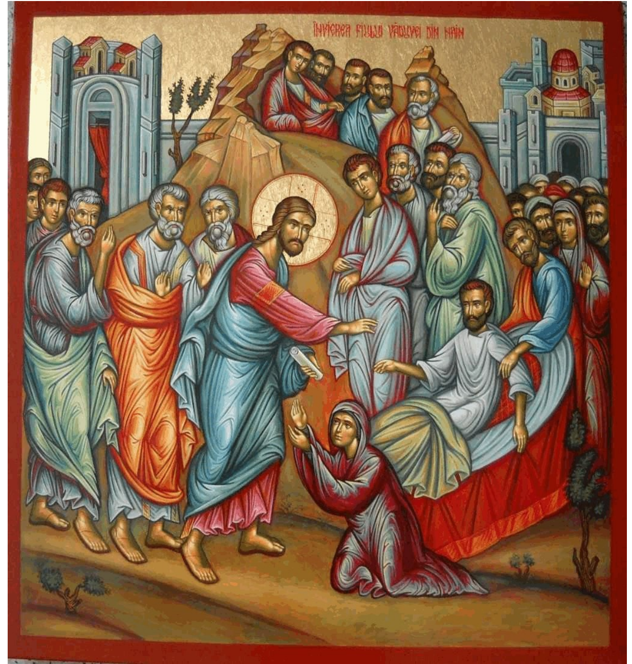
JESUS RAISING THE SON OF THE WIDOW OF NAIN