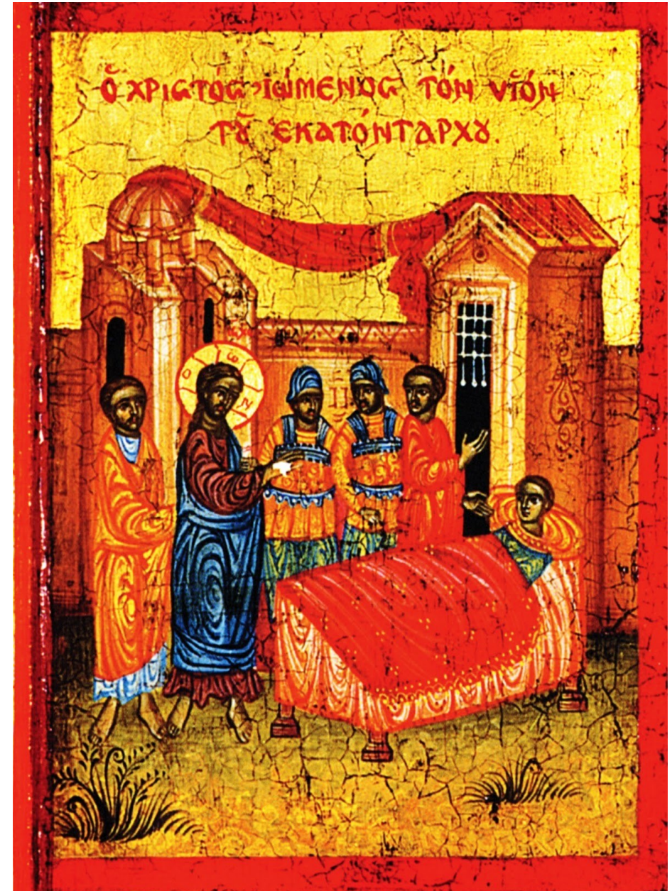
JESUS HEALING THE CENTURION'S SERVANT