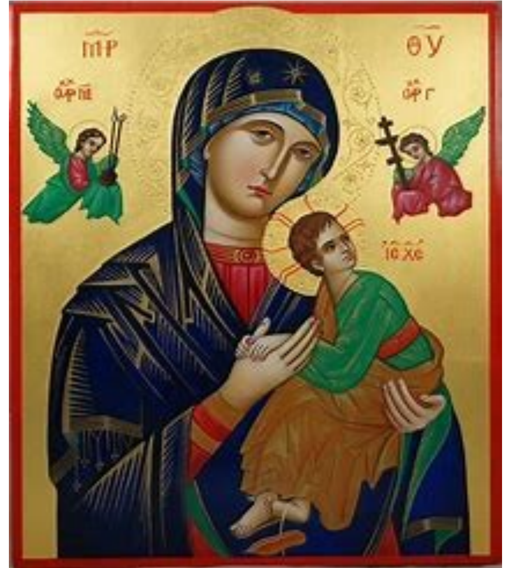
OUR LADY OF PERPETUAL HELP