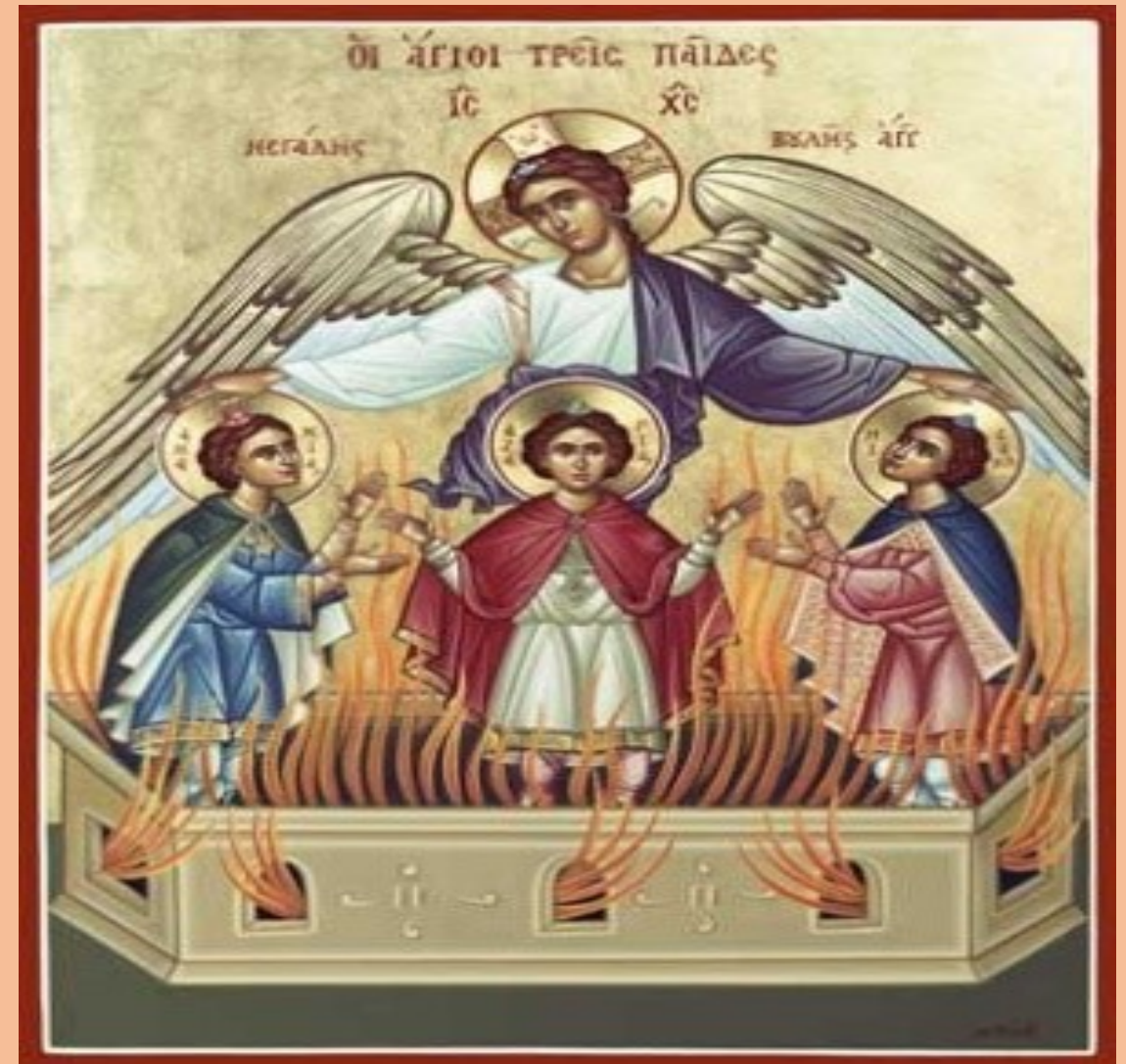
The Holy Youths Ananias, Azarias, & Mishael