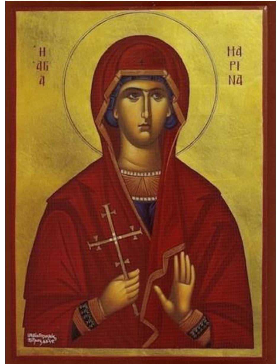
GREAT MARTYR MARINA JULY 17