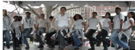
Music and Dancing!