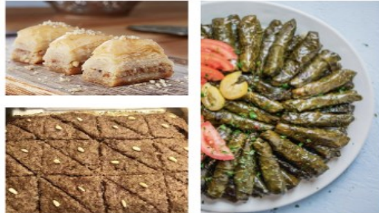
Food and Pastries!

««—»» 256 Hamilton St. Worcester, MA 01604