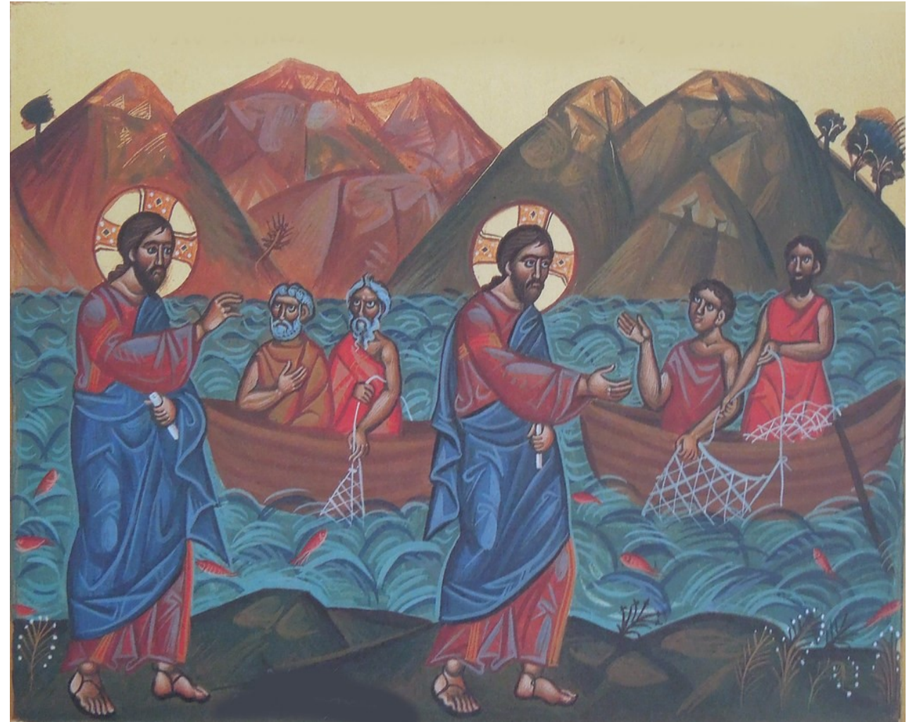
JESUS CALLING THE FIRST APOSTLES

SECOND SUNDAY AFTER PENTECOST JUNE 19, 2022