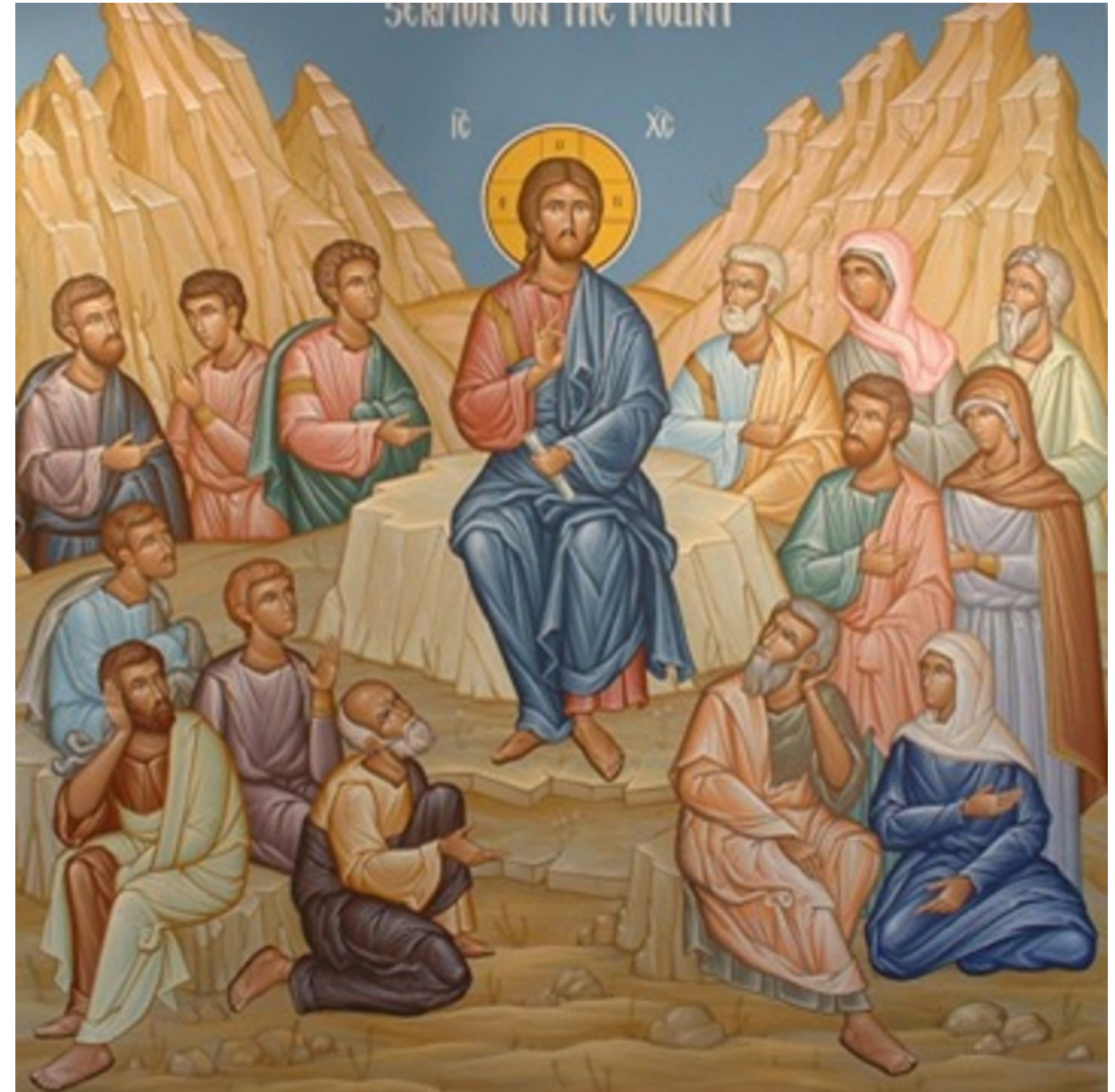
SERMON ON THE MOUNT