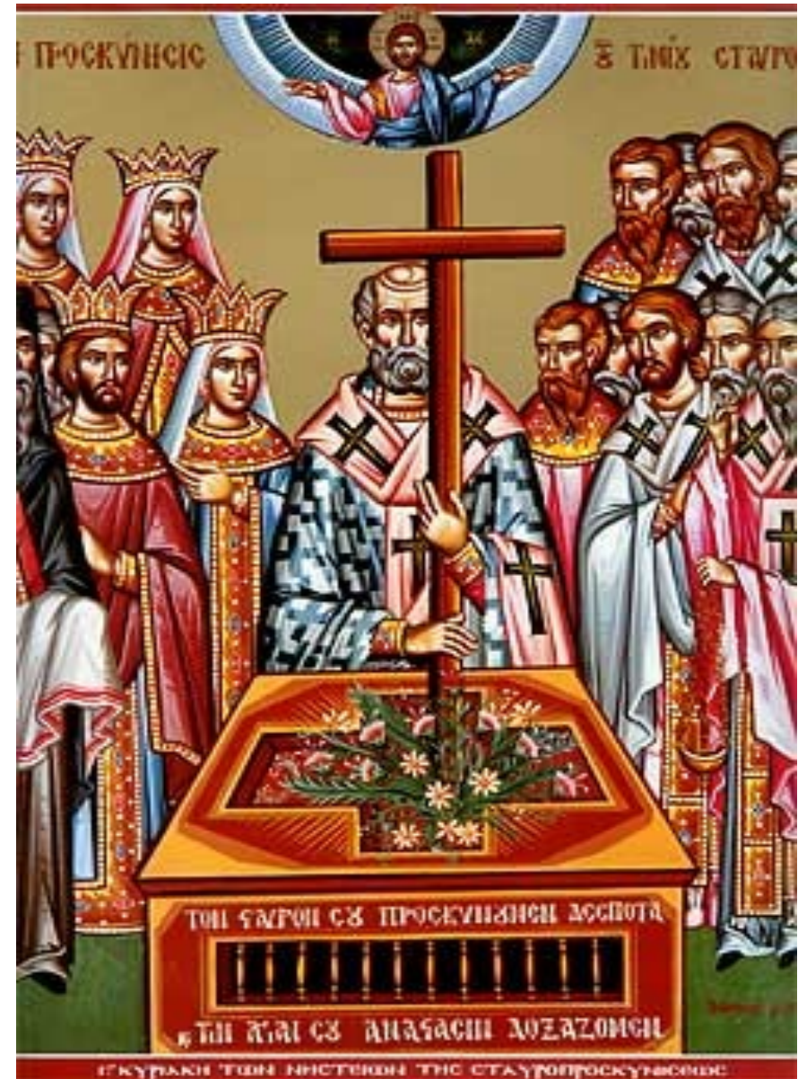
VENERATION OF THE HOLY CROSS