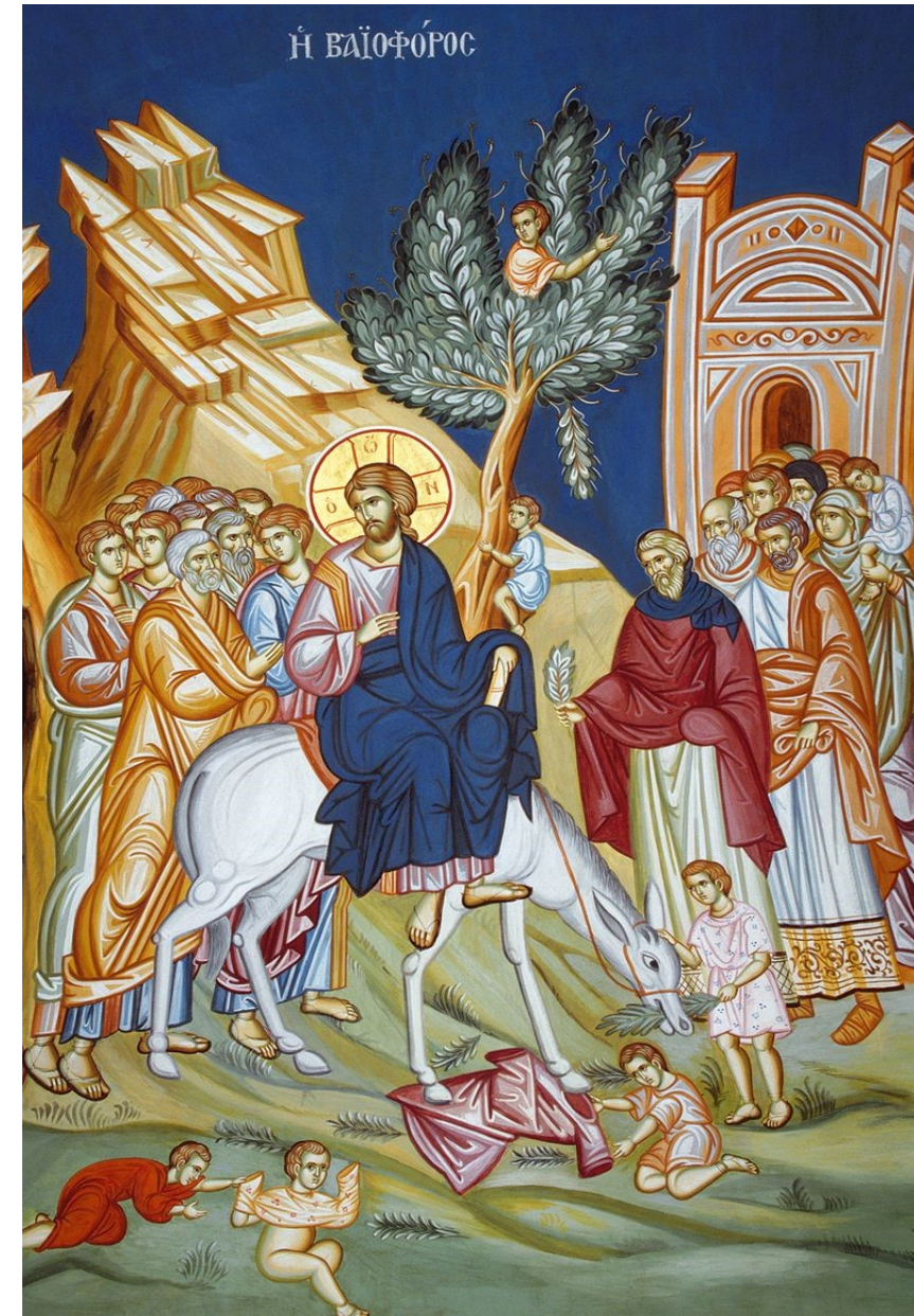
TRIUMPHAL ENTRY INTO JERUSALEM