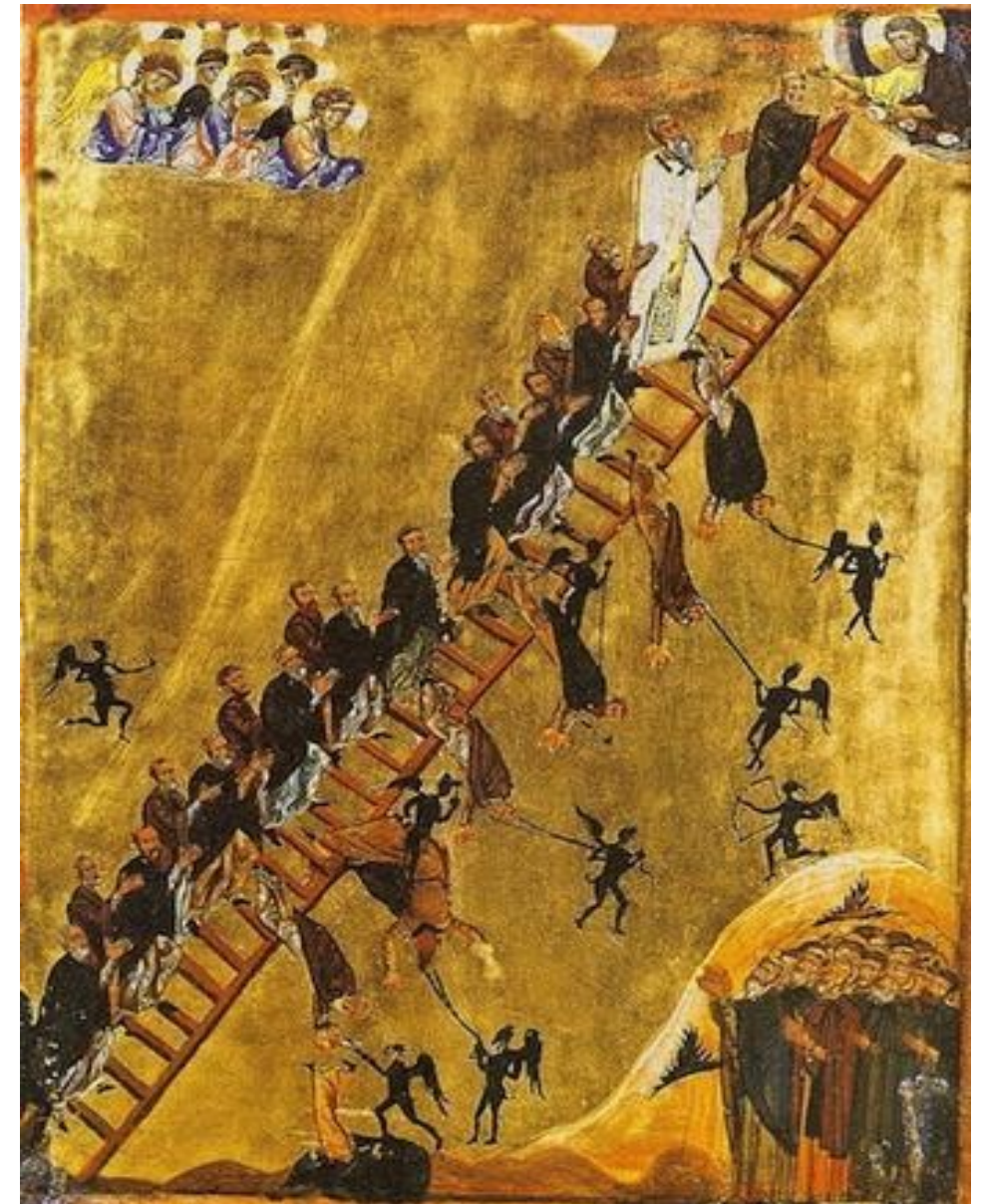
LADDER OF DIVINE ASCENT