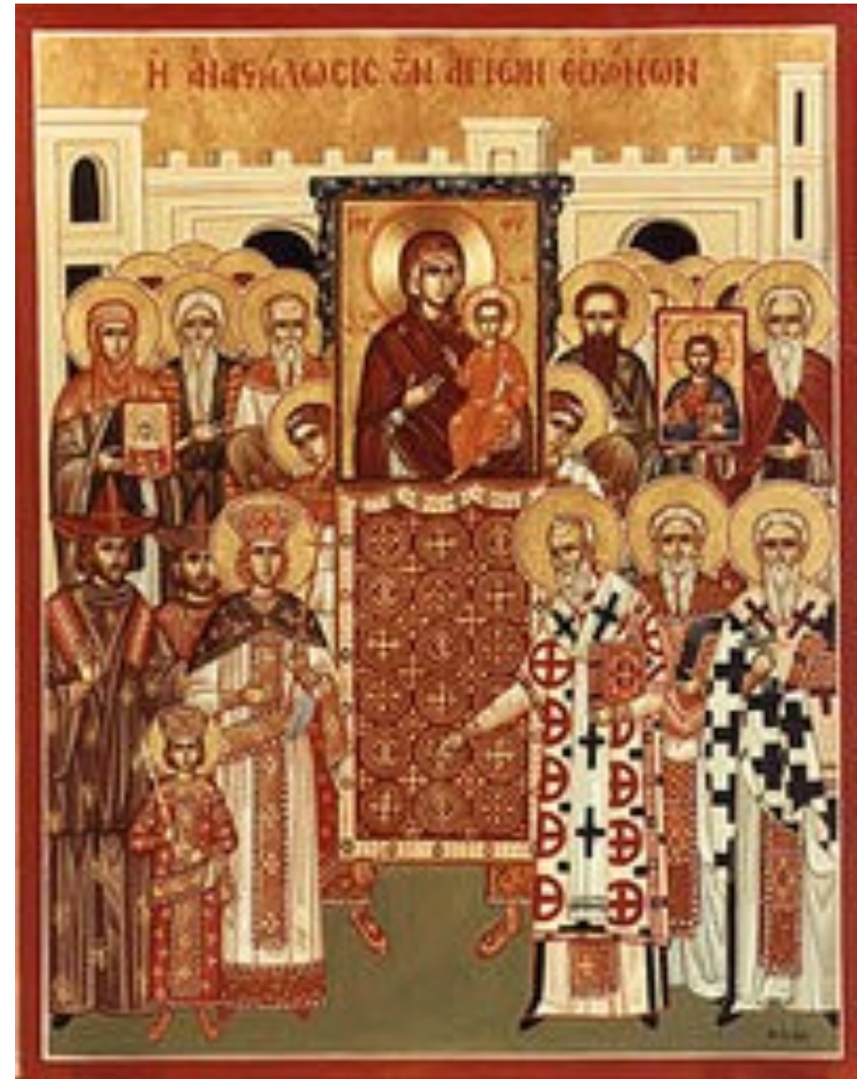
RESTORATION OF THE ICONS