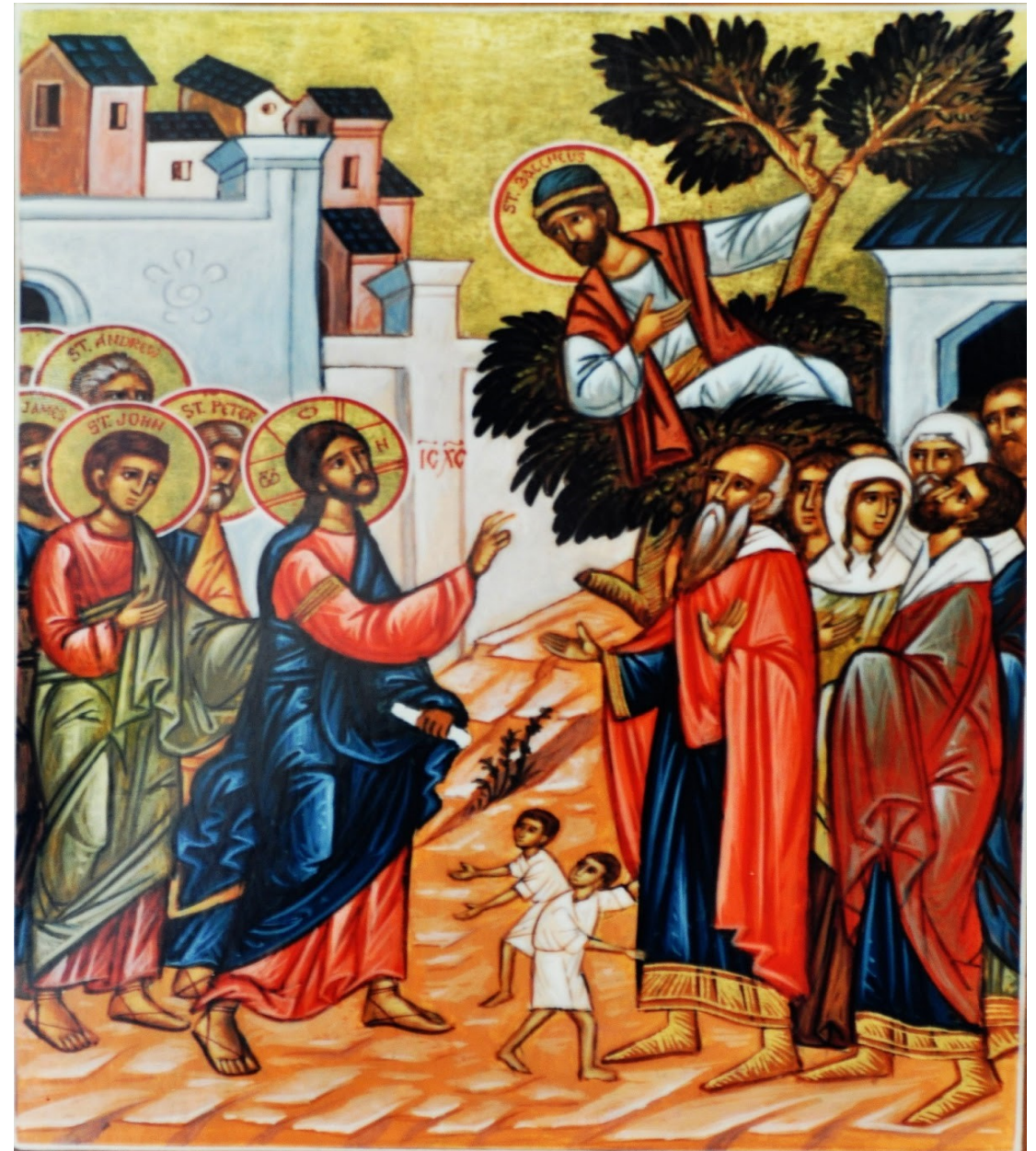
JESUS CALLING ZACCHAEUS