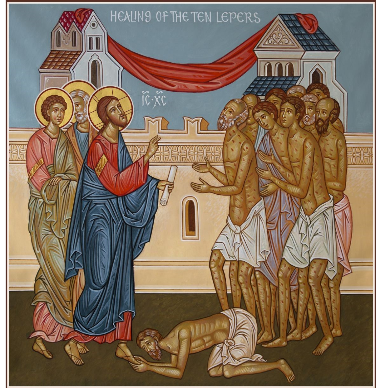
JESUS HEALING THE TEN LEPERS